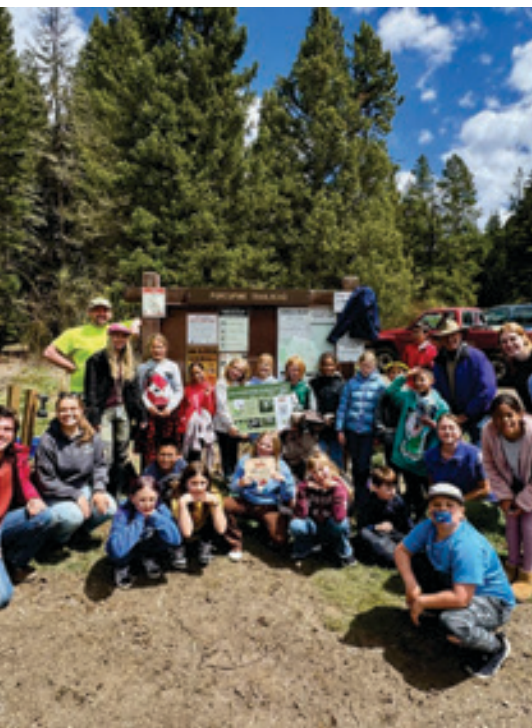
PlayCleanGo Sign @ Porcupine