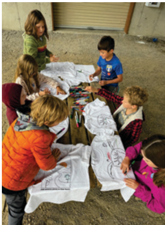
All About Invasives Field Trip